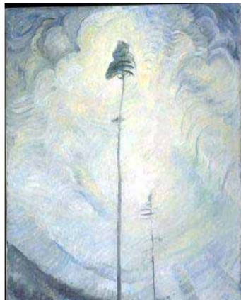
Fig. 1. Scorned as Timber, Beloved of the Sky, "Emily Carr et la côté ouest Pacifique," La Vie Artistique au Canada , Université Mount Allison, 2001, Web. 22 June 2007. < http://www.mta.ca/faculty/arts/canadian_studies/francais/realites/ >.

Artwork, photographs, graphs, charts, line drawings, maps and other visuals are considered to be illustrations and are labeled with the abbreviation Fig. followed by an Arabic number directly under the illustration. Number the figures consecutively as they appear in the text. Place each figure as close to the first reference as possible, but not before the reference. A brief title follows on the same line as the figure, then the source information.