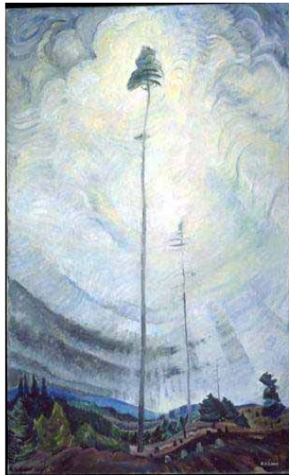
Figure 1. Scorned as Timber, Beloved of the Sky. Emily Carr. From "Emily Carr et la côté ouest Pacifique." (2001). La Vie Artistique au Canada . Université Mount Allison. Retrieved June 22, 2007, from http://www.mta.ca/faculty/arts/canadian_studies/francais/realites/guide/artistique/emilycarr.html . Copyright 2001 by Université Mount Allison.

Artwork, photographs, graphs, charts, line drawings, maps and other visuals are considered to be illustrations and are labeled with the word Figure followed by an arabic number directly under the illustration. Number the figures consecutively as they appear in the text. Place each figure as close to the first reference as possible, but not before the reference. A brief caption (description) 1-2 sentences long can follow on the same line as the figure. If the illustration comes from another resource, identify the source using the appropriate format a line below the caption starting with the word From .